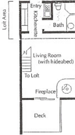
Units 5 and 6 (Upper level) Loft bedroom—1 bath Sleeps 5 Freestanding fireplace Deck Approx. 448 sq. ft. total (124 sq. ft. in loft)